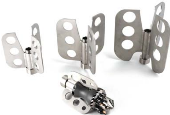
Turbo II w/ rigid guide skid