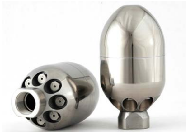
Flying nozzle – 3D large

Extended warranty 36 months with ceramic nozzle inserts