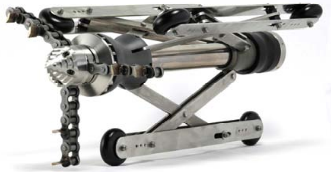
Turbo III w/ flexible guide skid