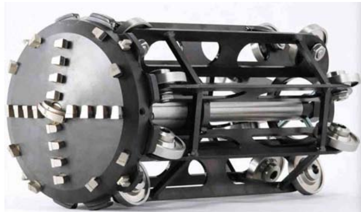
Milling cutter, type VII