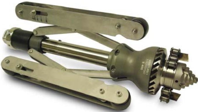
Turbo S 400 8"-16"