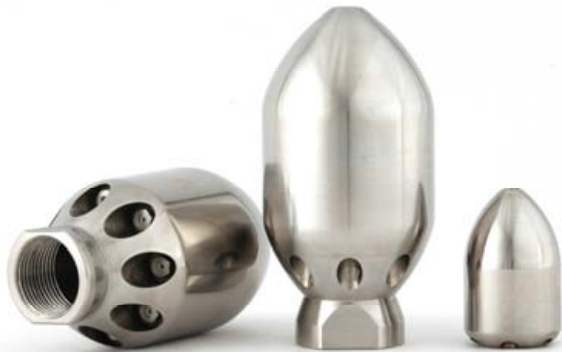
Flying nozzle – 3D small