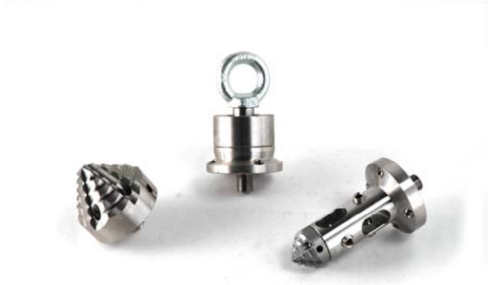
Accessories for Turbo