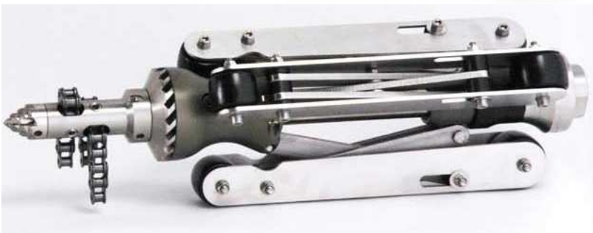
Turbo II w/ flexible guide skid