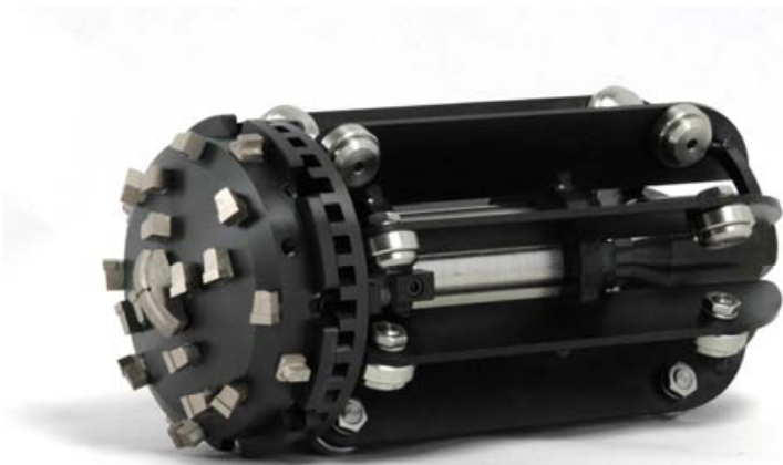
Milling cutter, type V

All milling cutters are capable of removing the toughest deposits such as hard grease, concrete and scale of all kinds, even tuberculation in cast iron pipes. Protruding tabs will be cut gently without damaging the line.