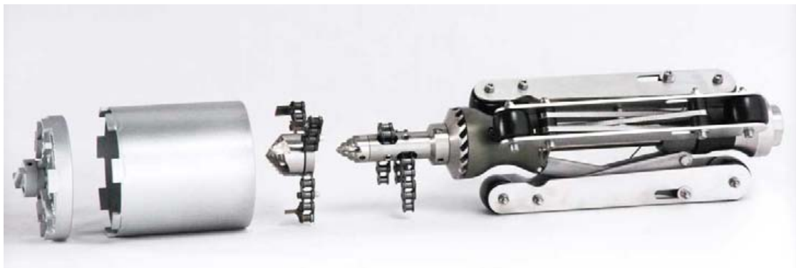
Turbo II flexible w/ accessories