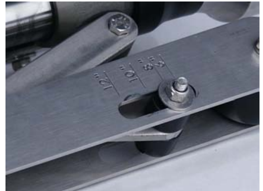
Turbo flexible guide skid